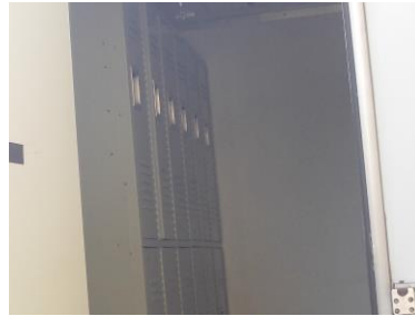
DTCH Fire Escape