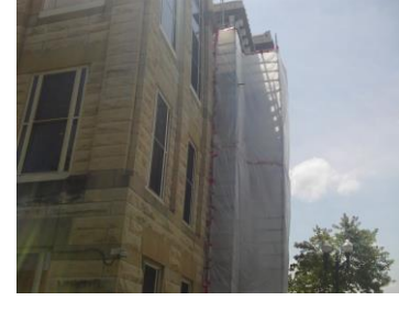
DTCH Fire Escape