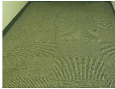
Carpets by Auditor