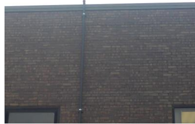
HVAC new gas lines