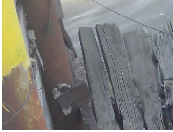
Midwest Barge Terminal